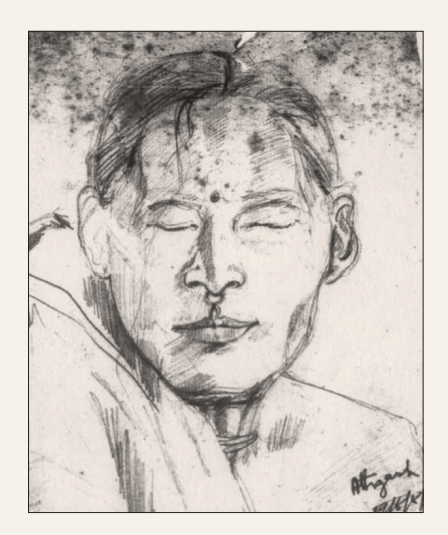
Mother, Charcoal on paper, 1959