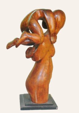
Child's Desire. Wood sculpture, 1965